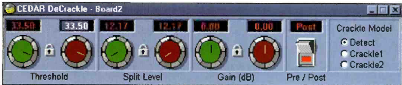
Detail of the Decrackle control panel

signal path with eight processes in series, or anything in between. For instance, given six boards, two chains of DeClick, DeCrackle and DeHiss could be set up to run simultaneously on separate signals under independent control, all accessed from the Console.